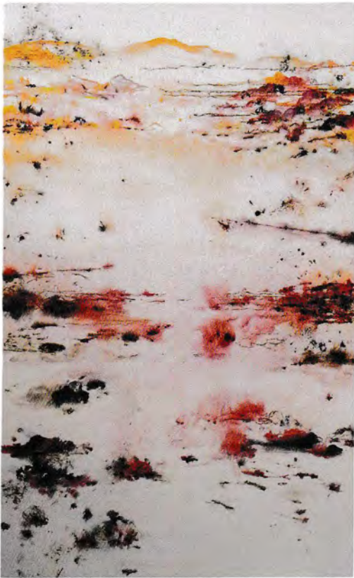
Hanibal Srouji, Terre Mer XII, 2013, Fire Acrylic Canvas, 232 x 142cm