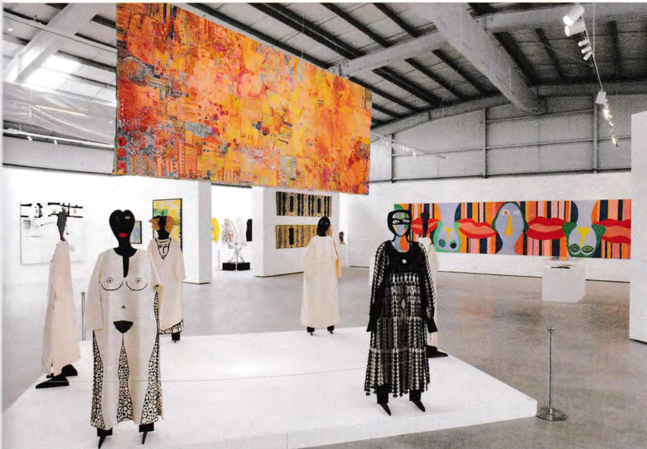
Installation View Huguette Caland at Beirut Exhibition Center, January 16 - February 24, 2014