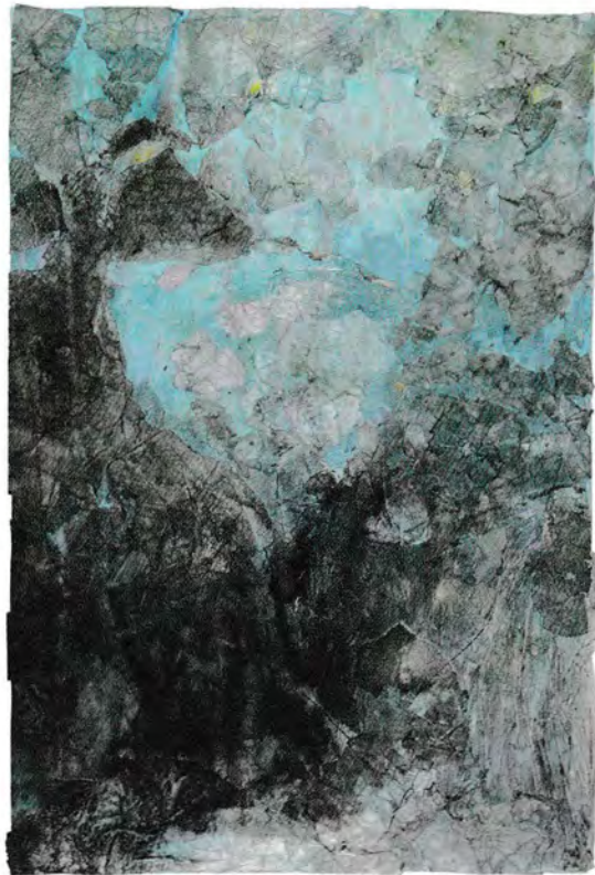
Zad Moutaka, Jardin Clos I, 2016, Mixed Media on Paper Mounted on Canvas, 224x150cm